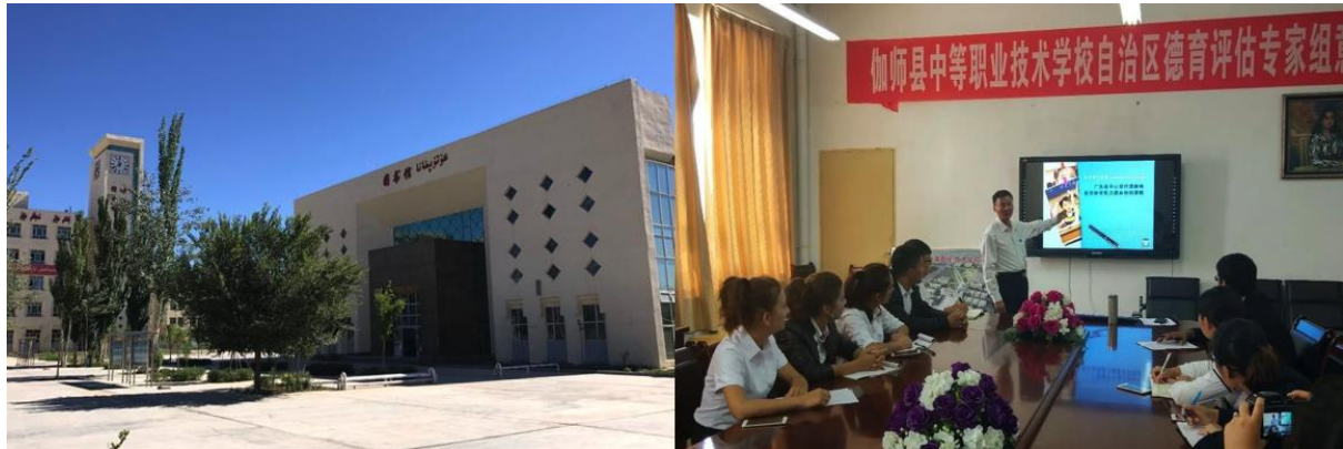
Left image: Red signage says “Library”, in both Chinese and Uyghur-Arabic Right image caption: “New teachers participating in their six-hour induction training”

It is difficult to believe that the authors of the ASPI report did not view these photographs in the course of their research.