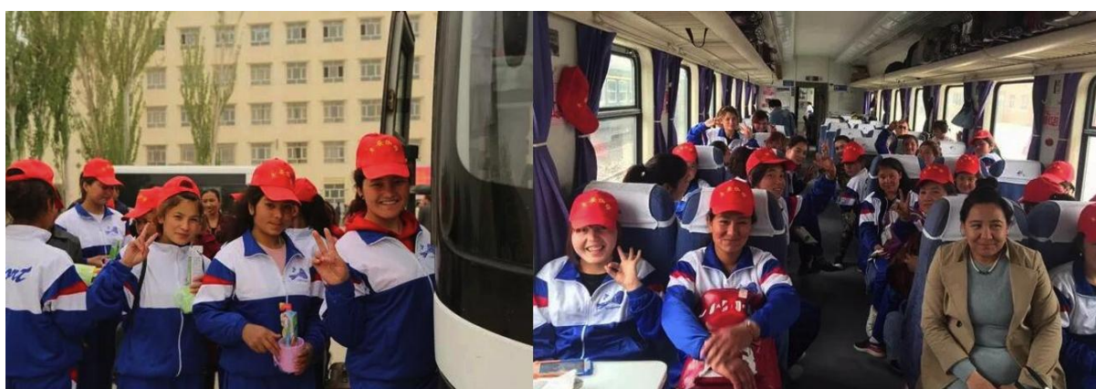
Left image caption: "Happy to embark on the road to work" Right image caption: "Taking a train to a new life"