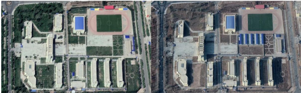
Left image: 2017 autumn satellite image showing no buildings in the centre of the school yet Right image: 2018 winter satellite image analysed by Mr Ruser showing a set of five newly constructed rectangular buildings in the centre of the school

What supports this deduction is that the set of five rectangular buildings with blue roofs in the centre of the school is not present in an earlier satellite image from 2017 (on the next page). This means that between 2017 and 2018, those five buildings were under construction, which would explain the existence of the internal fences around those buildings.