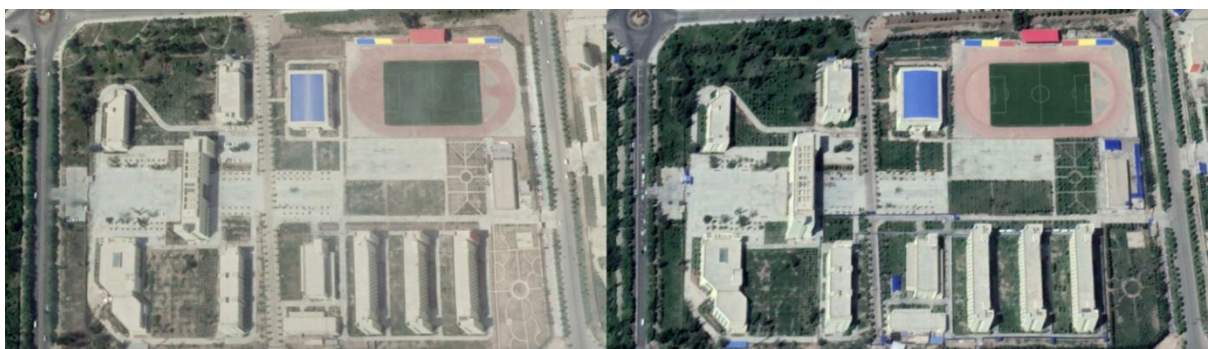
Left image: 2016 spring satellite image showing twelve buildings Right image: 2017 autumn satellite image showing twelve buildings

Mr Ruser stated at endnote 107 of the ASPI report that, “[b]eginning in early 2017, seven new dormitory-style buildings were constructed alongside five prefabricated factory buildings, strongly suggesting that the former school was converted into a re-education camp”. A first common-sense point to make is that a high school expanding its infrastructure does not mean it has been converted to a re-education camp. Indeed, it is a very peculiar conclusion to reach. A second observation to make is that there were no new buildings added to the school in early 2017, as Mr Ruser claimed, as evidenced by a comparison with a 2016 satellite image of the school.