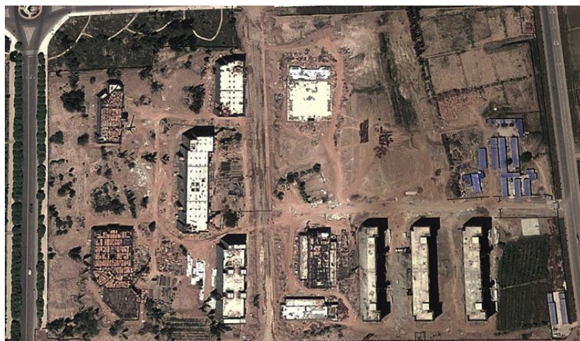
2012 satellite image showing the Jiashi County Secondary Vocational School still under construction

Mr Ruser also indicated at endnote 107 that the Jiashi County Secondary Vocational School is actually a re-education camp or political indoctrination camp because enrolments increased from less than 500 students in 2013 to over 7000 students in 2019. It is important to note that Mr Ruser failed to include the 2012 satellite image below which shows that the school was still under construction in 2012. 126 Thus, one explanation for an increase in student enrolment is that the school only had the infrastructure capacity for 500 students in 2013, which increased over time as more buildings were completed externally and internally.