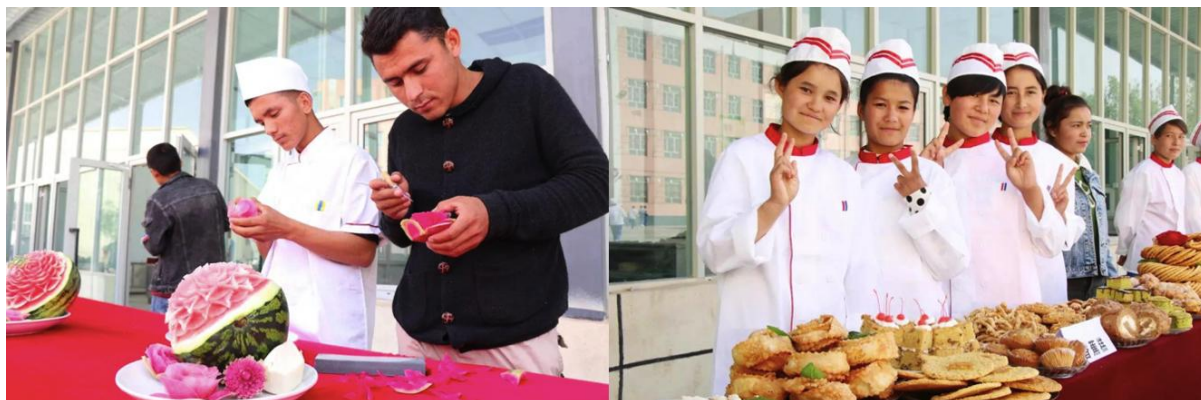
Left image caption: "Fruit-carving exhibition" Right image caption: "Pastry-making exhibition"