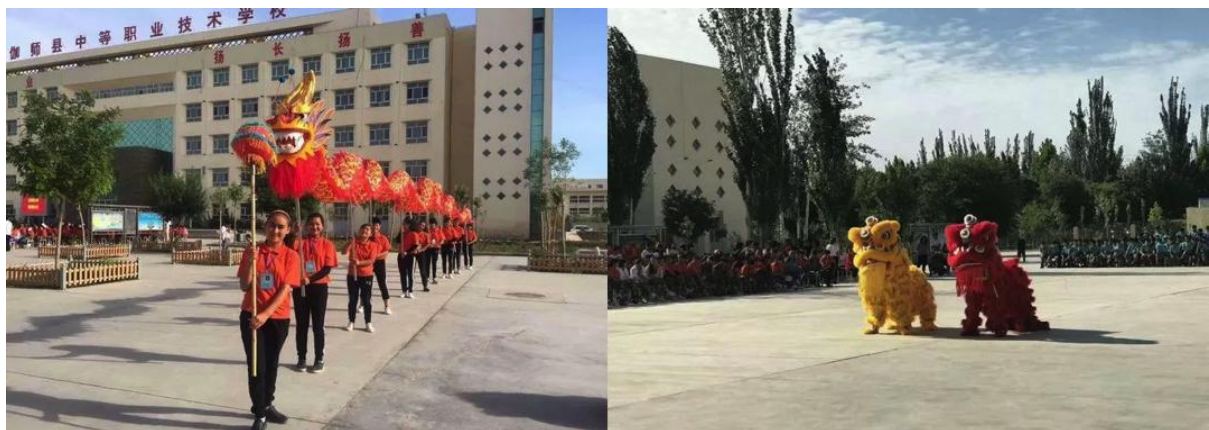
Left and Right image: Students on campus practising dragon dancing