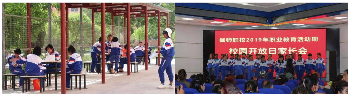
Left image: Students in their school uniforms on the school campus Right image: Students and parents attending the “School Campus Open Day Parent Meeting”

Account, 15 May 2019 < online >; ‘Jiashi County Secondary Vocational School Students Learn Dragon and Lion Dances’, Official Jiashi Government WeChat Account, 23 June 2018 < online >.